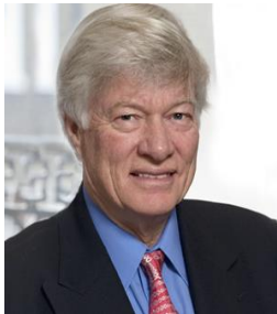
Geoffrey Robertson QC - Consultant

Geoffrey Robertson QC is founder and joint head of Doughty Street Chambers. He has had a distinguished career as a trial and appellate counsel, an international judge, and author of leading textbooks. He has argued many landmark cases in media, constitutional and criminal law, in the European Court of Justice; the European Court of Human Rights; the Supreme Court (House of Lords and Privy Council); the UN War Crimes courts; the World Bank's International Centre for Settlement of Investment Disputes and in the highest courts of many commonwealth countries. Mr Robertson was the first President of the UN War Crimes Court for Sierra Leone and served as a 'distinguished jurist' member of the UN's internal justice council. He is the author of Crimes Against Humanity: The Struggle for Global Justice .